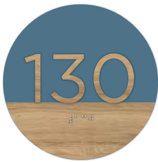
ROOM NUMBER PART# SLI24SN-1000 5.5" X 5.5"