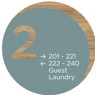
4 LINE DIRECTIONAL SIGN PART# SLI24DU-1104 15.5" x 15.5"