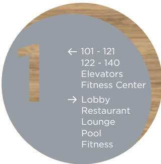
9 LINE DIRECTIONAL SIGN PART# SLI24TW-1109 15.5" x 15.5"