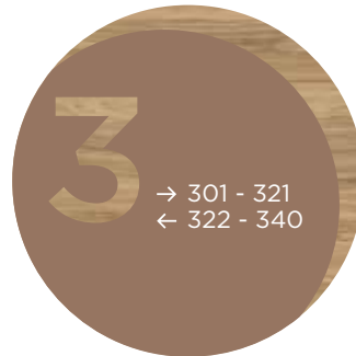
2 LINE DIRECTIONAL SIGN PART# SLI24DA-1102 15.5" x 15.5"